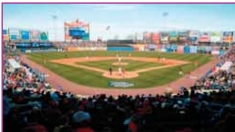
Coca-Cola Stadium - IronPigs vs. Phillies Exhibition Game 2008

Using PenTeleData's Suite Connect, Coca-Cola Park's network design supports many diverse technology requirements. The design incorporates three distinct networks: a staff network, a point of sale network for credit card purchases and a public network for the players and visitors – all with security and reliability in mind.